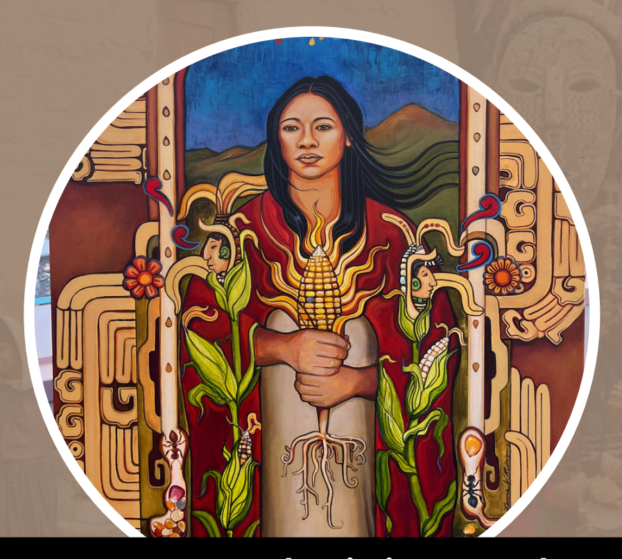
Culture, Race, Ethnicity, and Racism