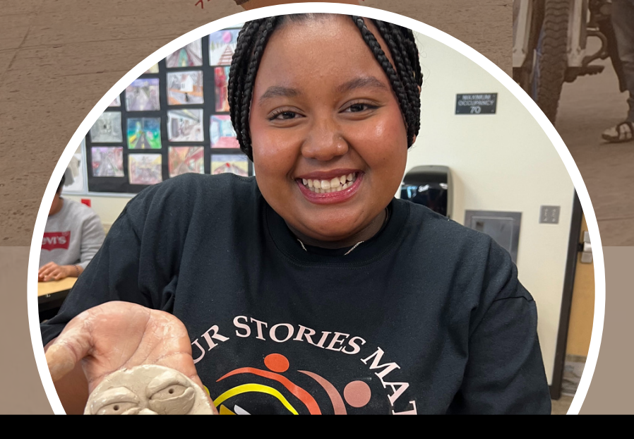
Theory & Methods in Cultural Anthropology