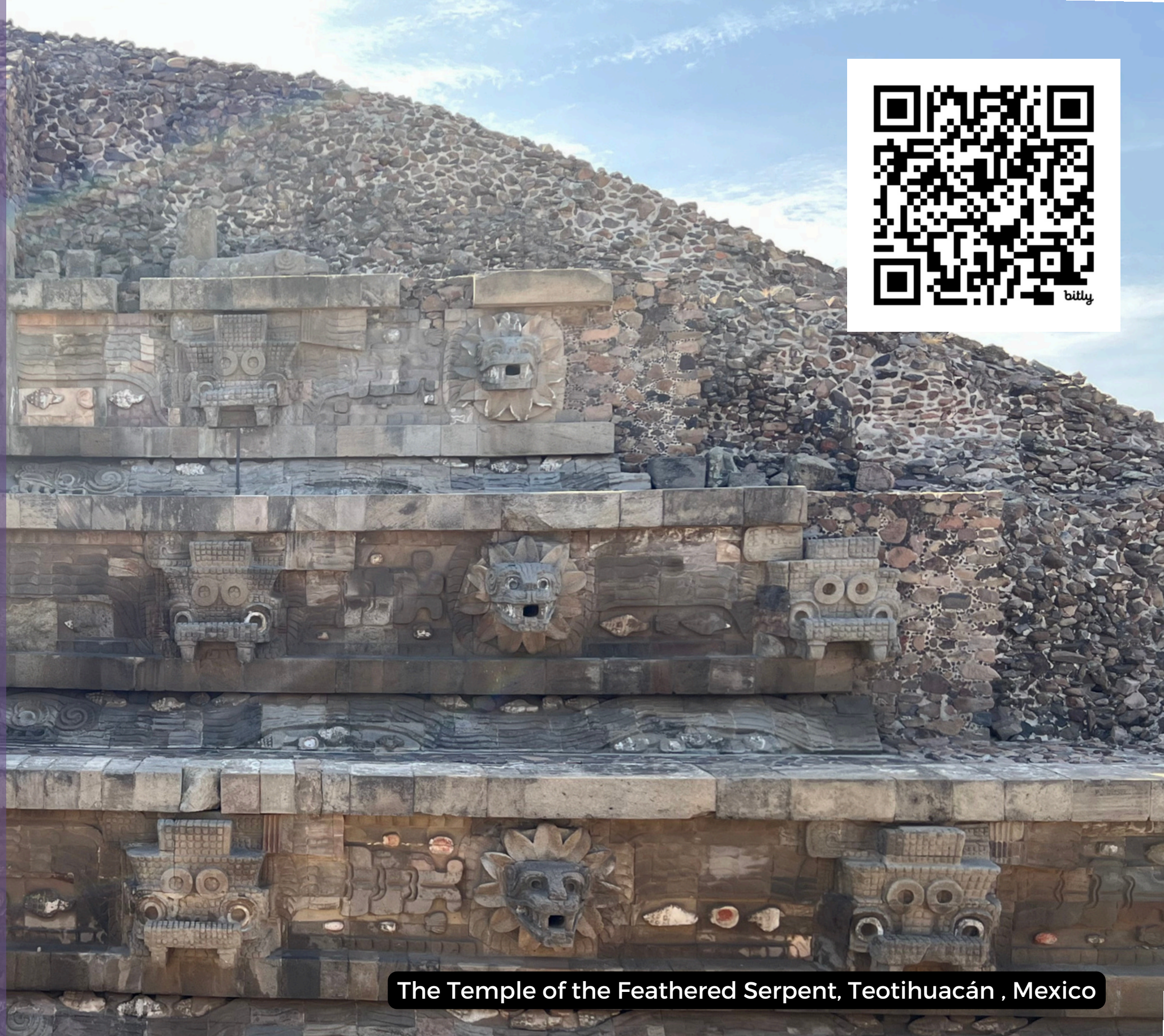
The Temple of the Feathered Serpent, Teotihuacán, Mexico